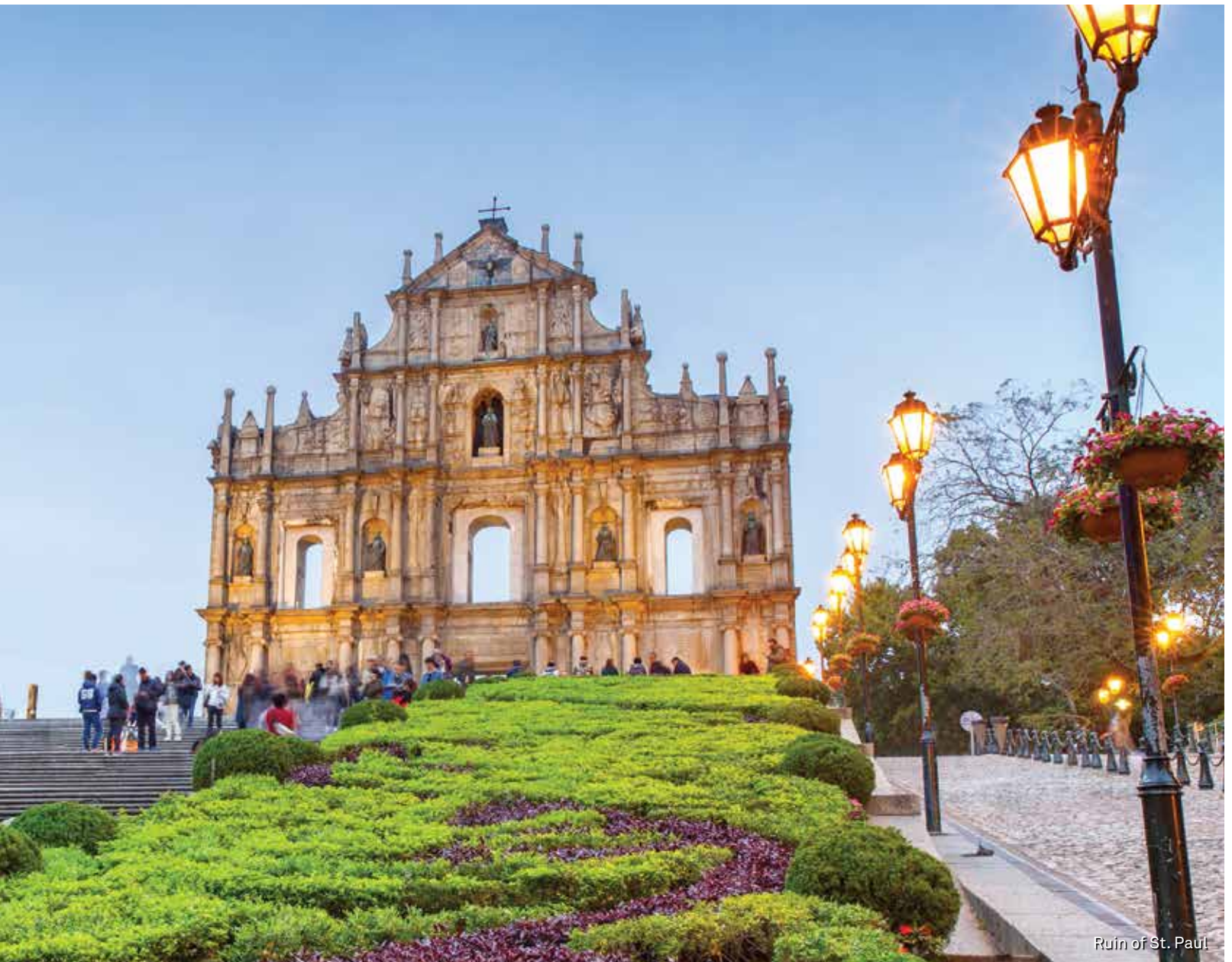
Ruin of St. Paul