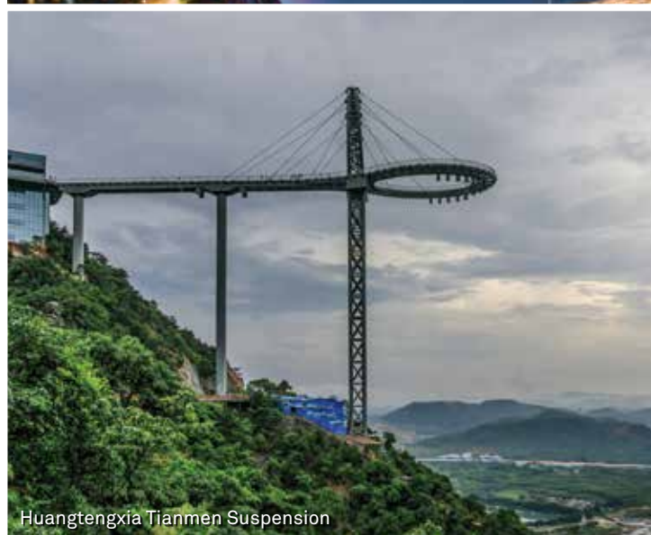
Huangtengxia Tianmen Suspension