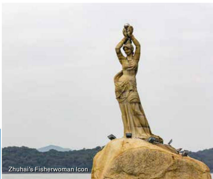
Zhuhai's Fisherwoman Icon