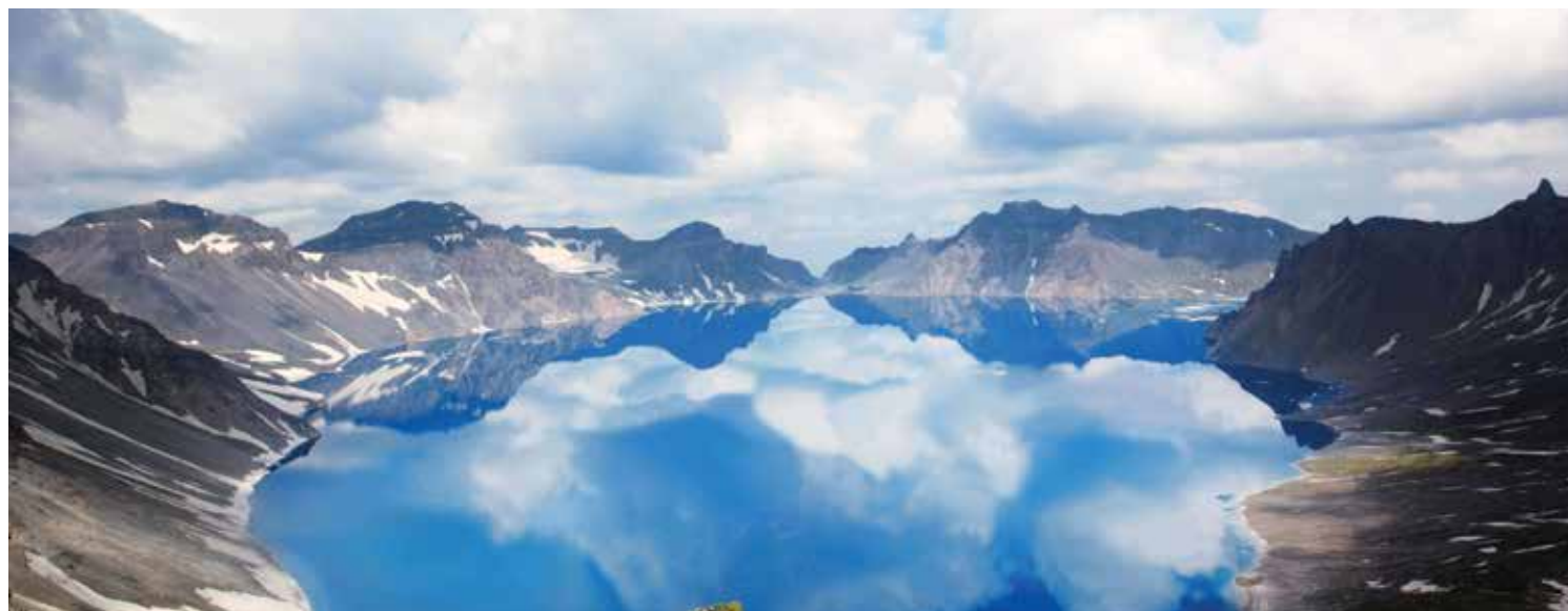
Mt. Changbai Western Slope Scenic Area