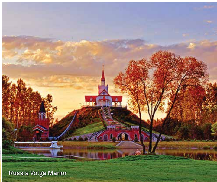
Russia Volga Manor