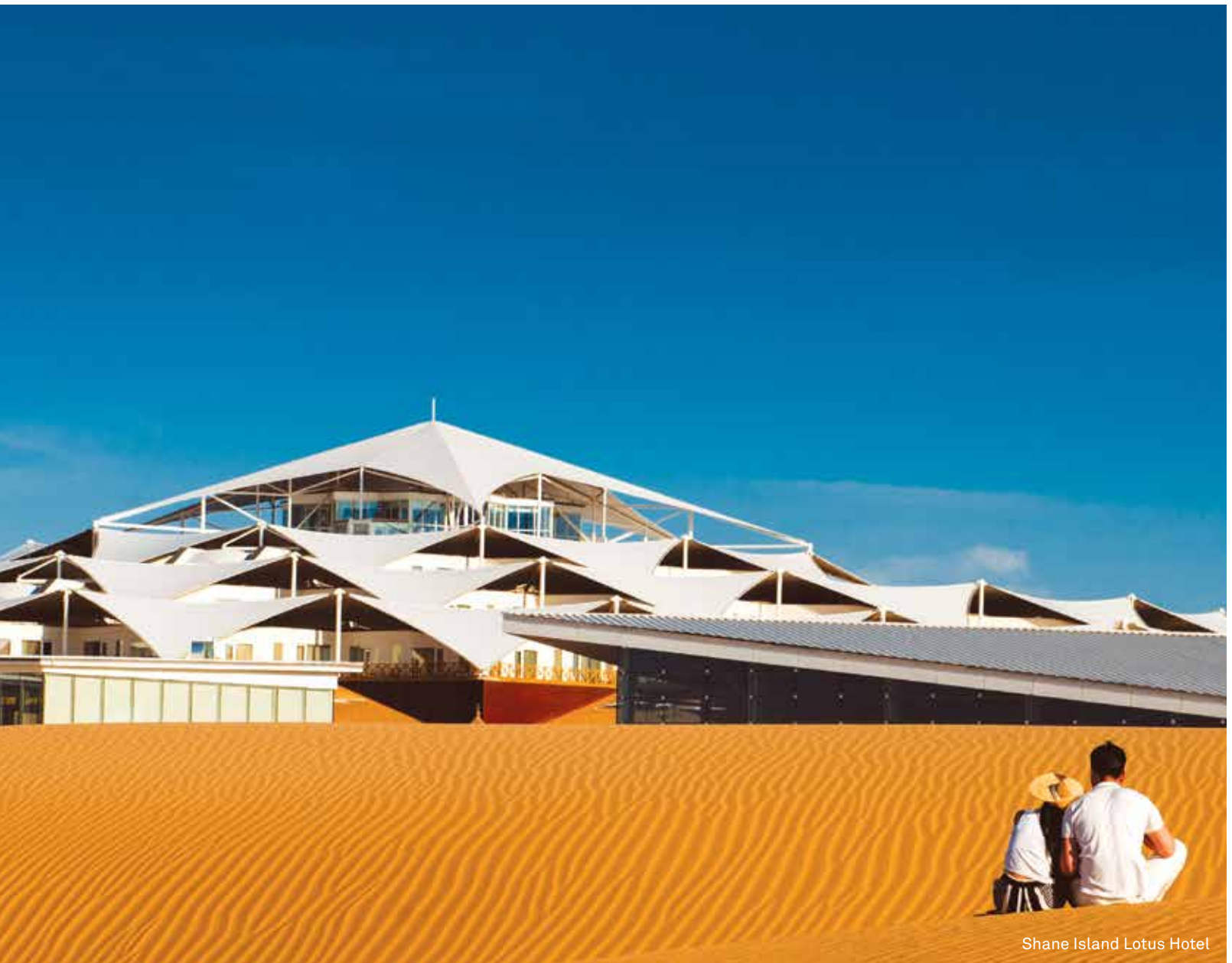
Shane Island Lotus Hotel