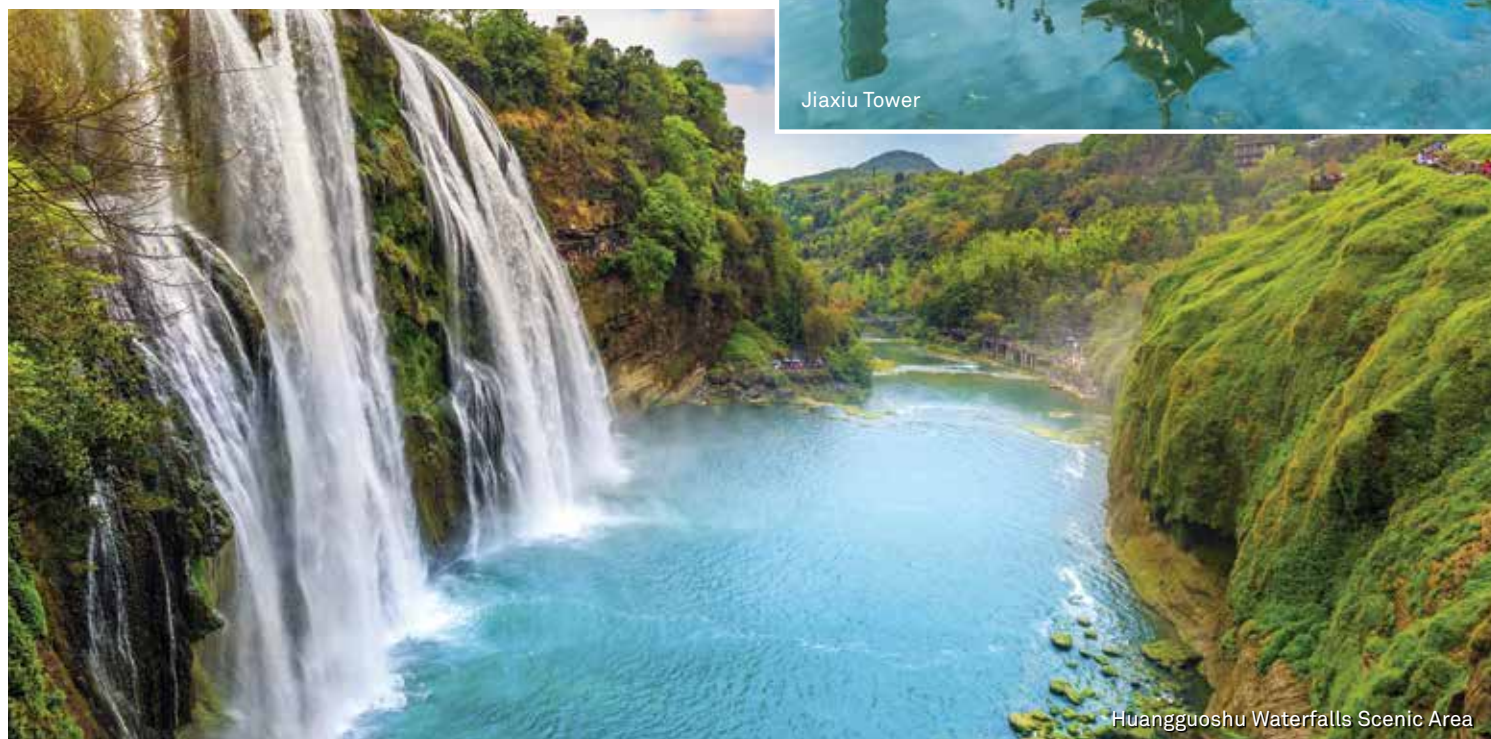
Huangguoshu Waterfalls Scenic Area