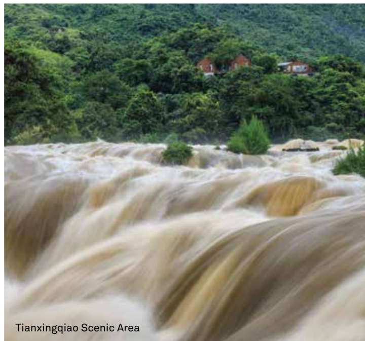
Tianxingqiao Scenic Area