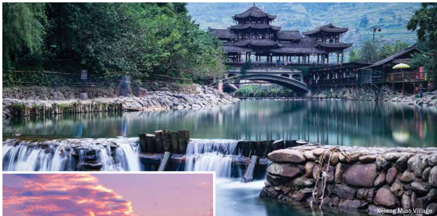
Xijiang Miao Village