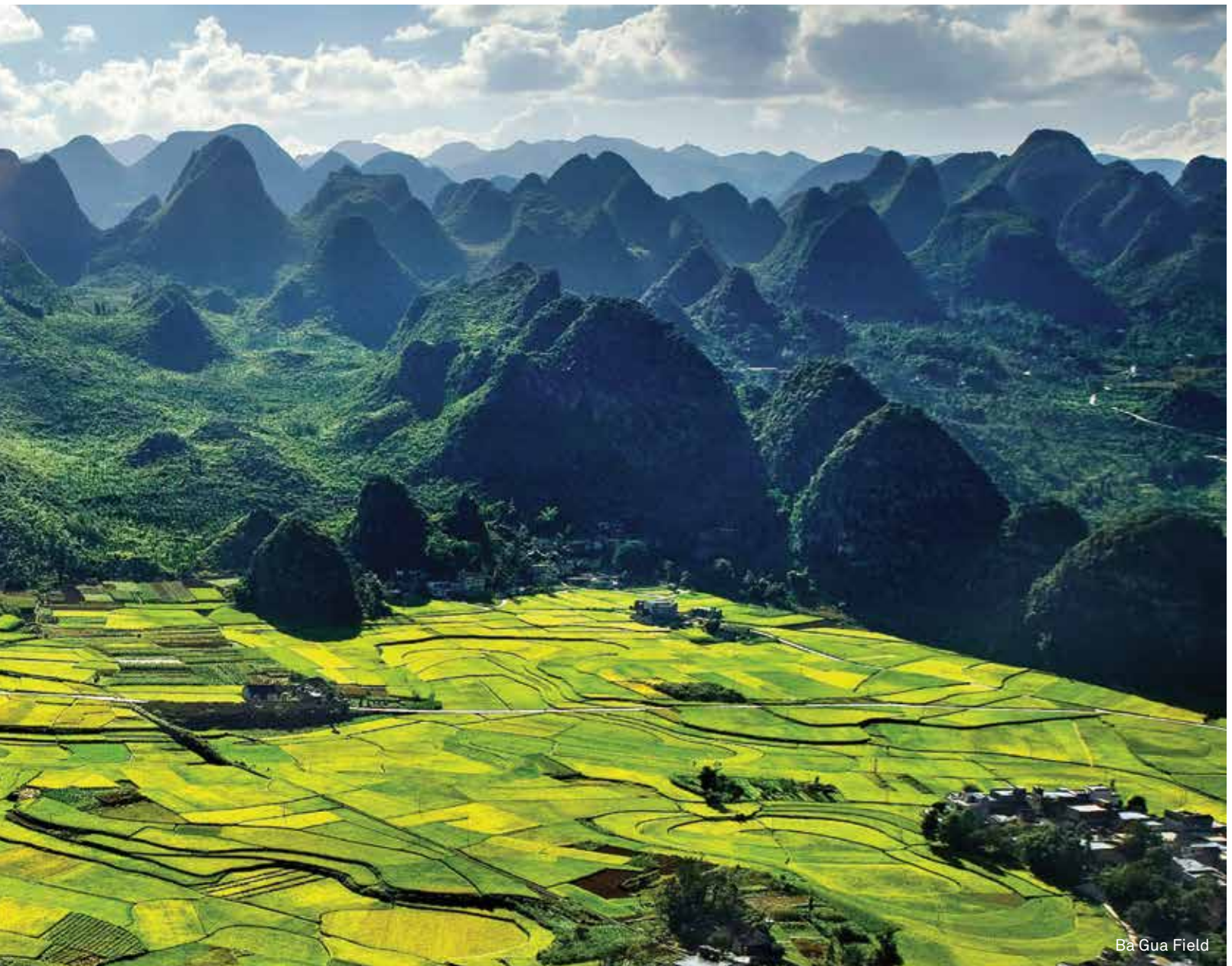
Ba Gua Field