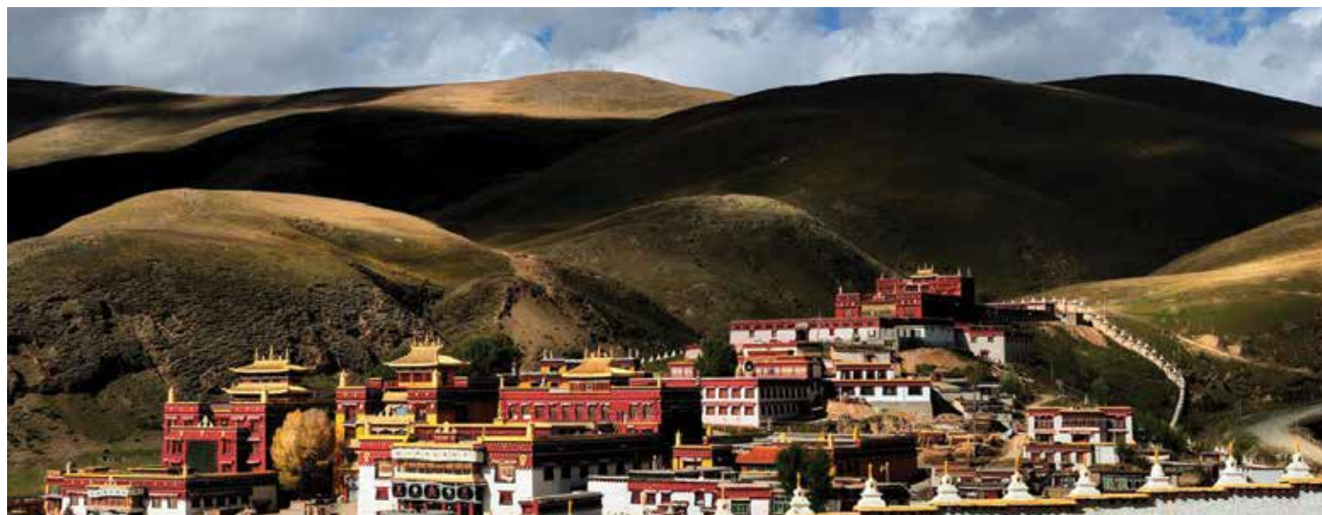
Changqingchun Keer Temple