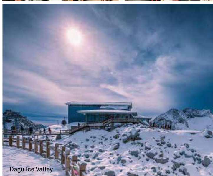
Dagu Ice Valley