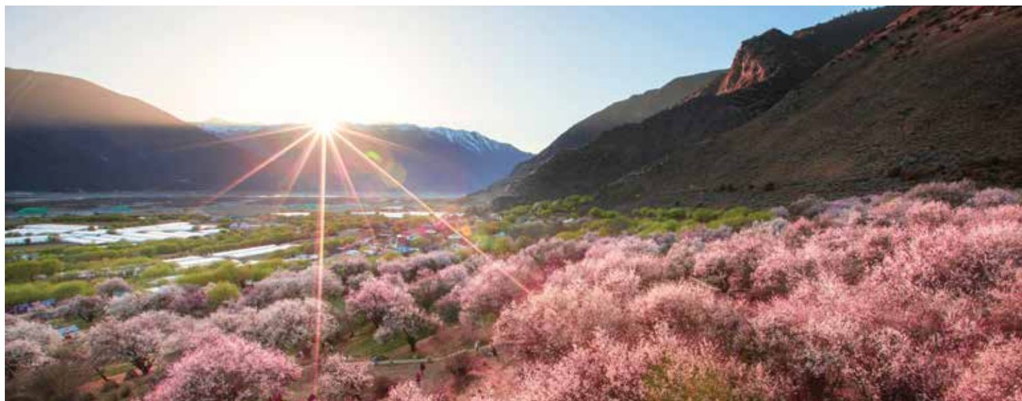
Nyingchi Peach Blossom Ditch