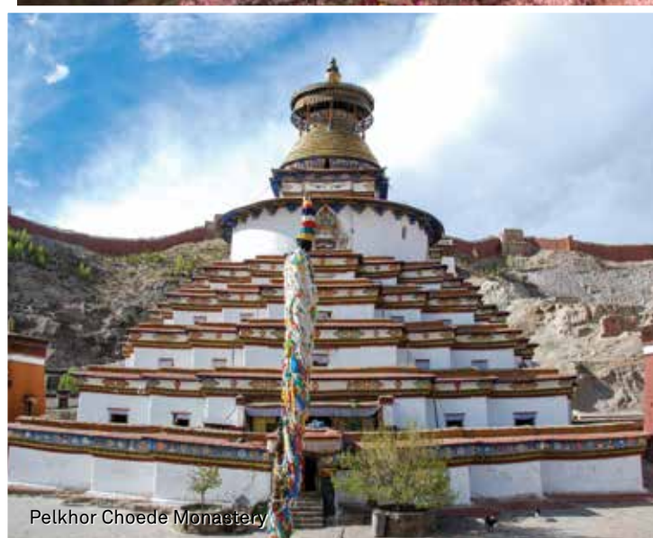
Pelkhor Choede Monastery