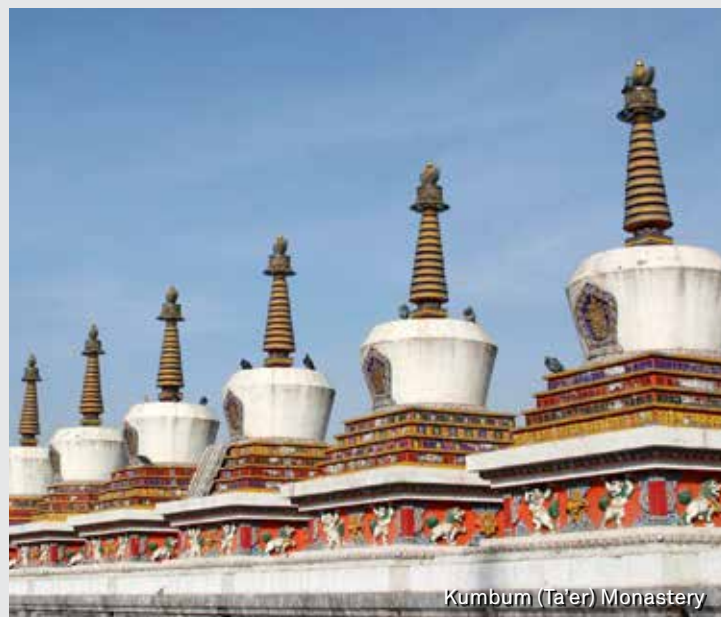
Kumbum (Ta'er) Monastery

🕒 Breakfast | Lunch | Dinner - Steam Pot Chicken