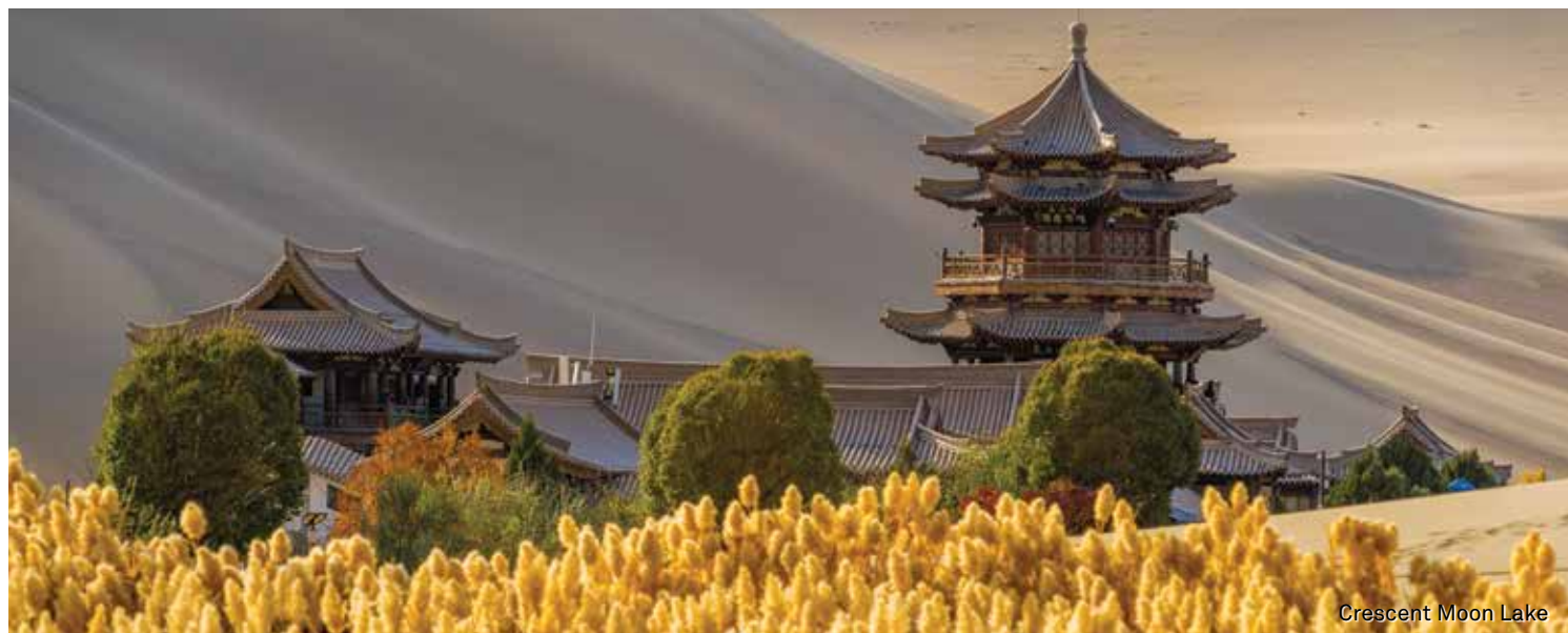
Crescent Moon Lake