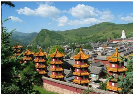
*** Mountain Wutai ***