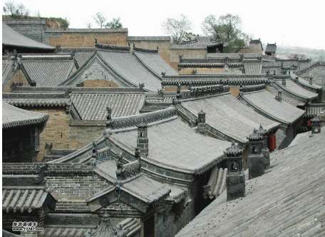
*** Pingyao Ancient City ***