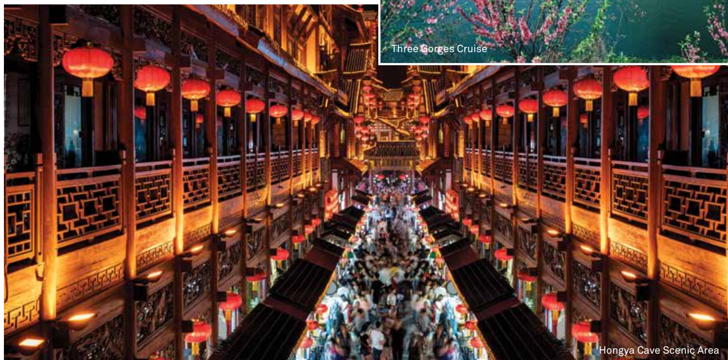
Hongya Cave Scenic Area