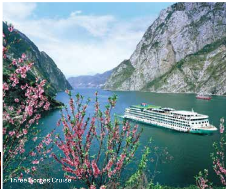
Three Gorges Cruise