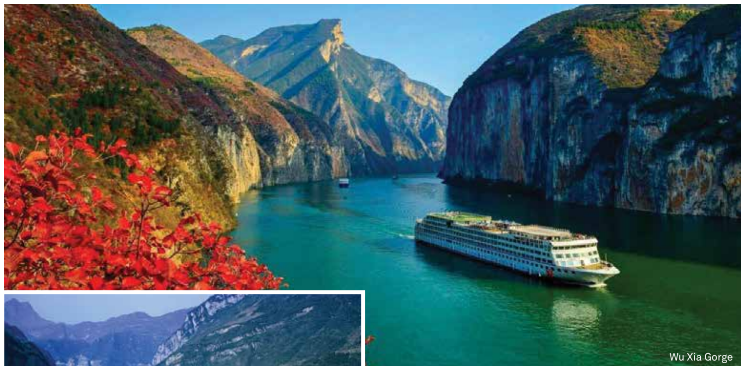
Wu Xia Gorge