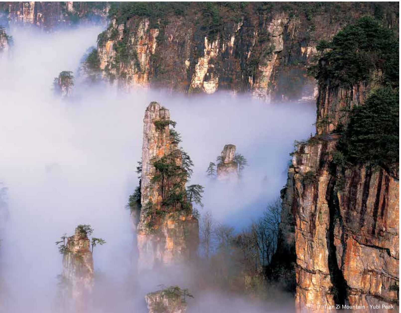
Tian Zi Mountain - Yubi Peak