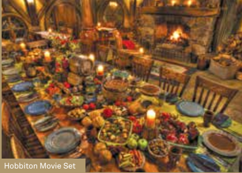
Hobbiton Movie Set