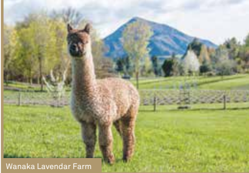
Wanaka Lavendar Farm