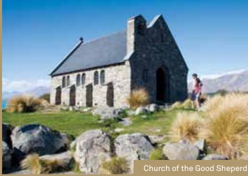
Church of the Good Shepherd