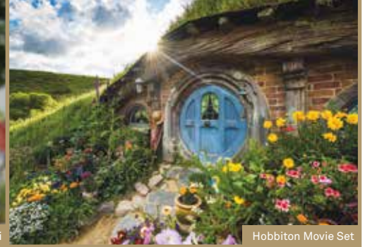
Hobbiton Movie Set