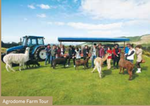
Agrodome Farm Tour