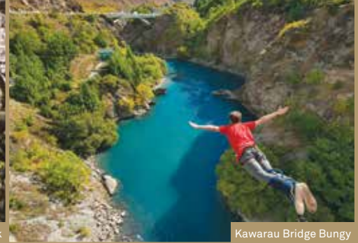
Kawarau Bridge Bungey

viewing decks that provide a safe and enjoyable area to witness the beautiful scenery and people doing the bungee jump.