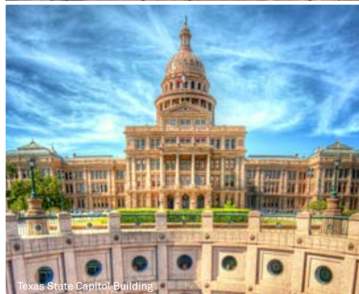
Texas State Capitol Building