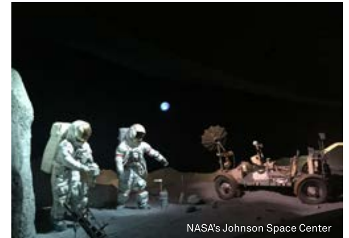
NASA's Johnson Space Center

Note: The sequence of the itinerary is subject to change without prior notice. During major conferences, fairs and festivals accommodation may be located outside the city or in an alternate city without prior notice.