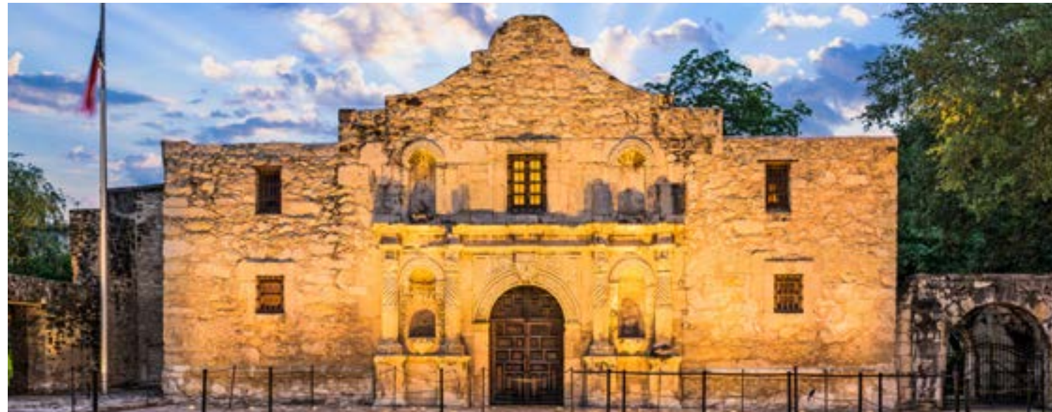
The Alamo in San Antonio