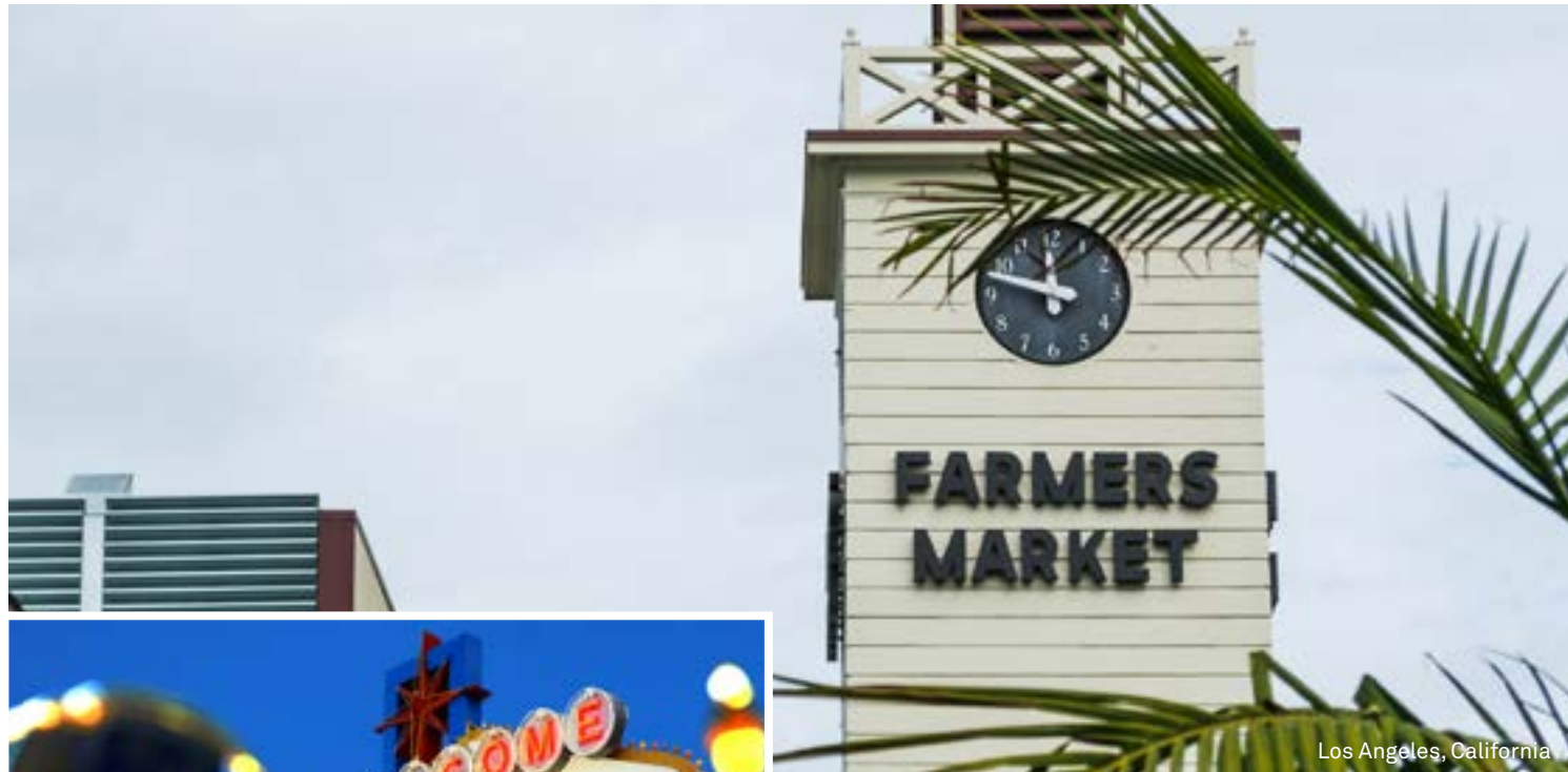
Los Angeles, California