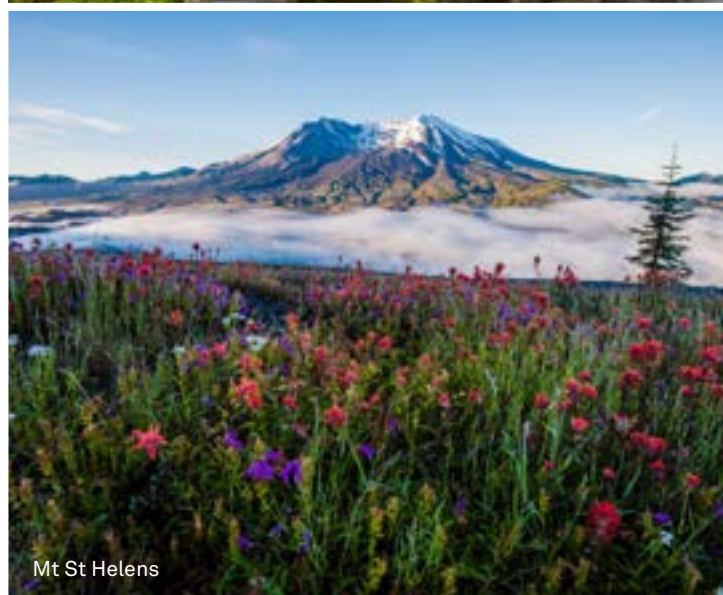
Mt St Helens