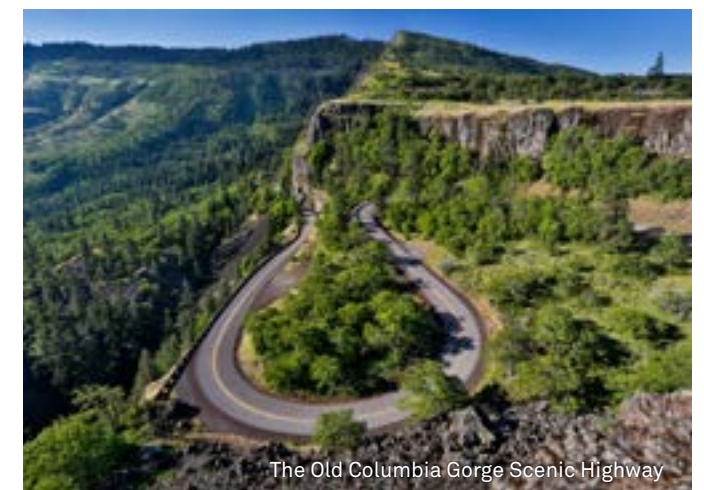
The Old Columbia Gorge Scenic Highway