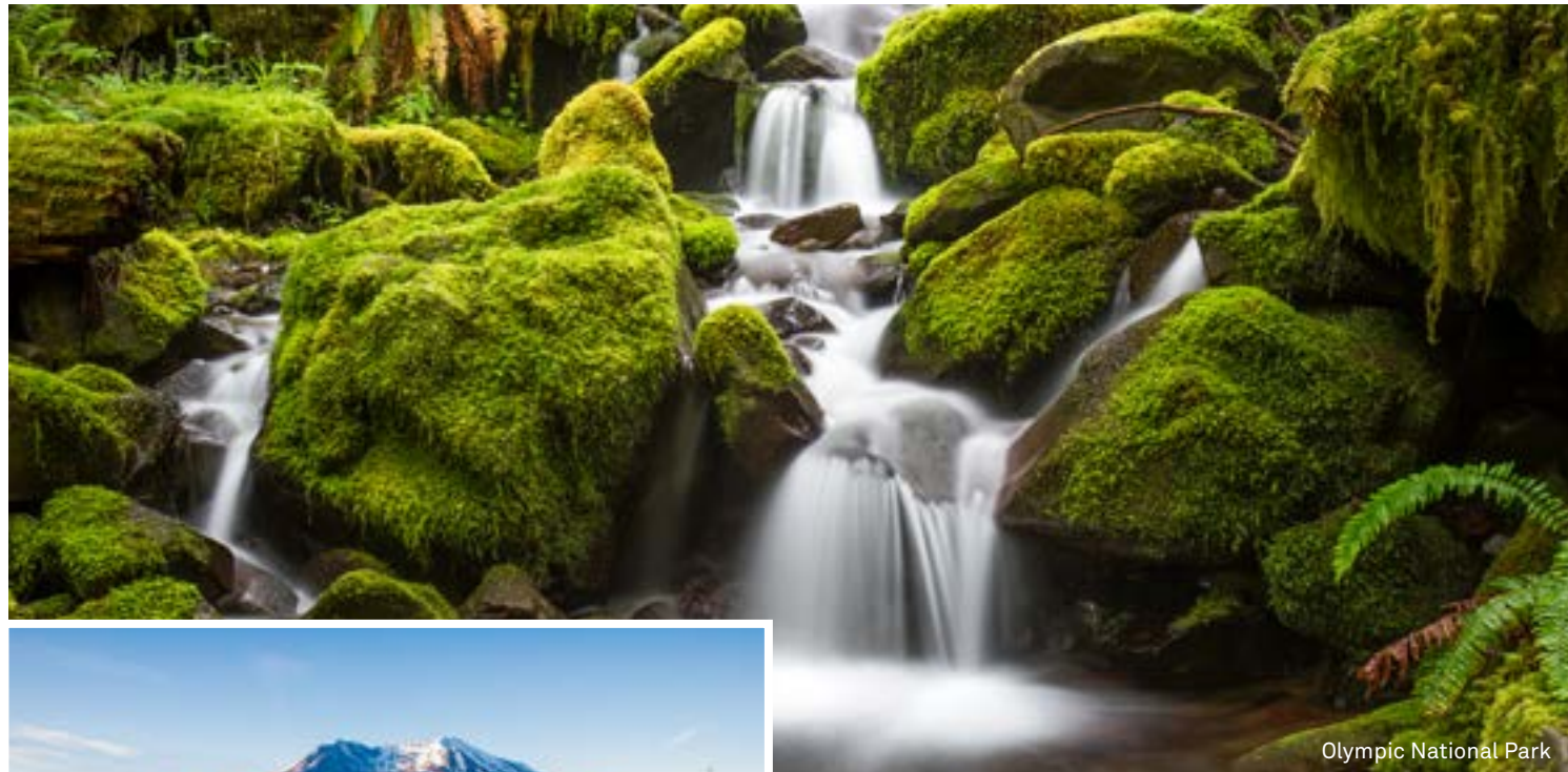
Olympic National Park