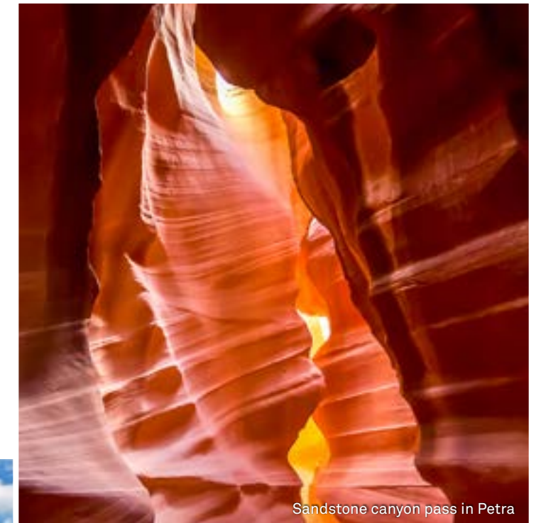
Sandstone canyon pass in Petra

The sequence of the itinerary is subject to change without prior notice. During major conferences, fairs, festivals and religious holidays, accommodation may be located outside the city or in an alternate city without prior notice. We respect local tradition and religious practises; as such we seek your understanding that services may sometime be slower on Shabbat Saturday which is a rest day for Jews.