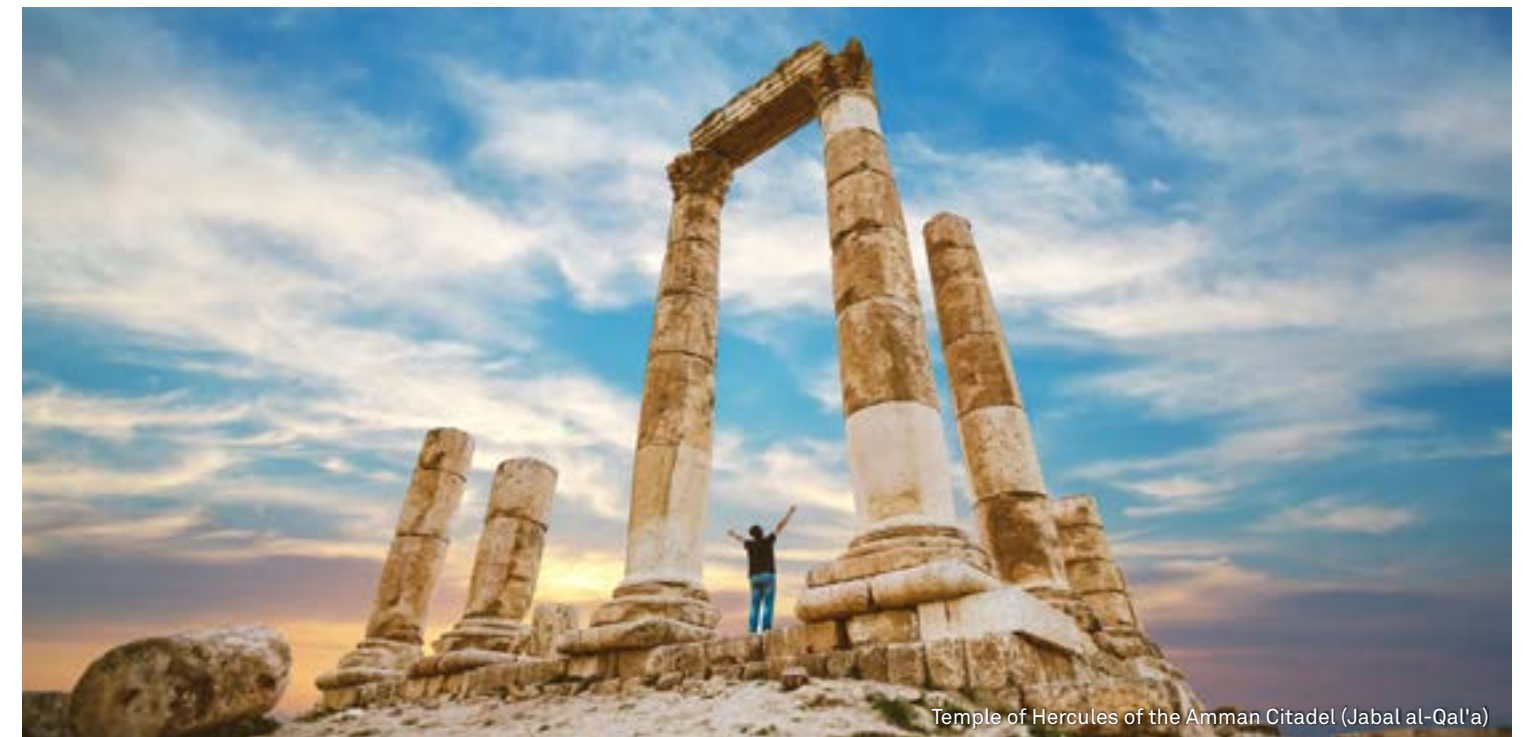
Temple of Hercules of the Amman Citadel (Jabal al-Qal'a)