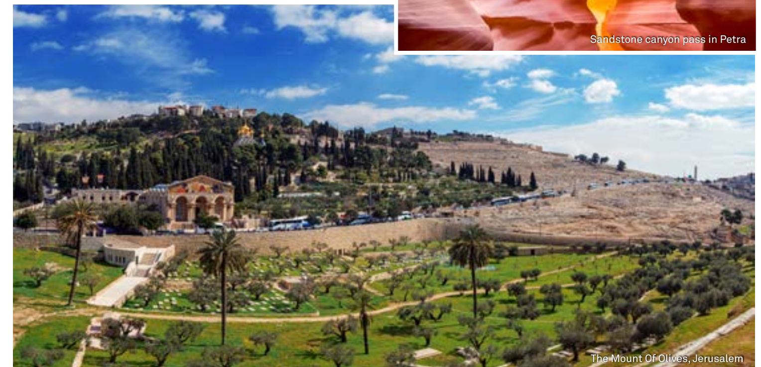
The Mount Of Olives, Jerusalem