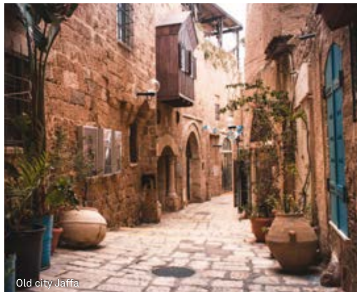
Old city Jaffa