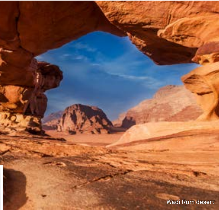
Wadi Rum desert